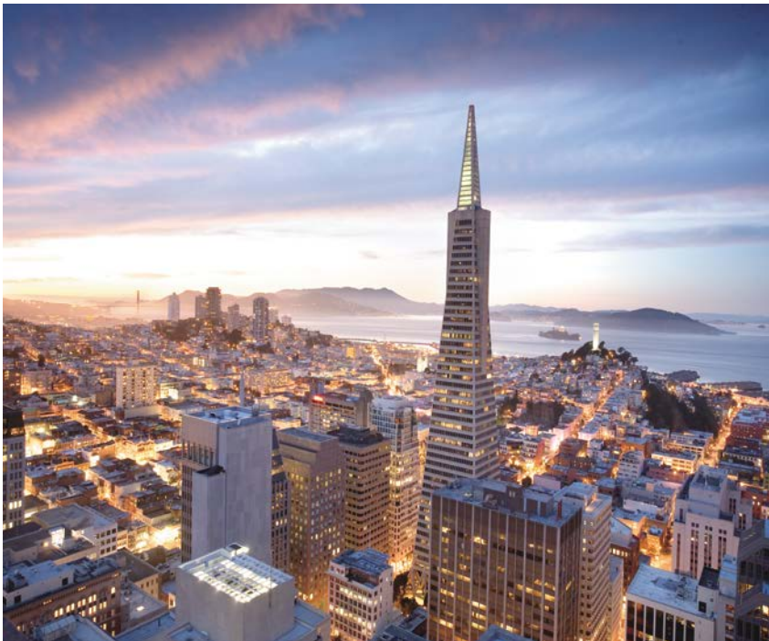
San Francisco Skyline