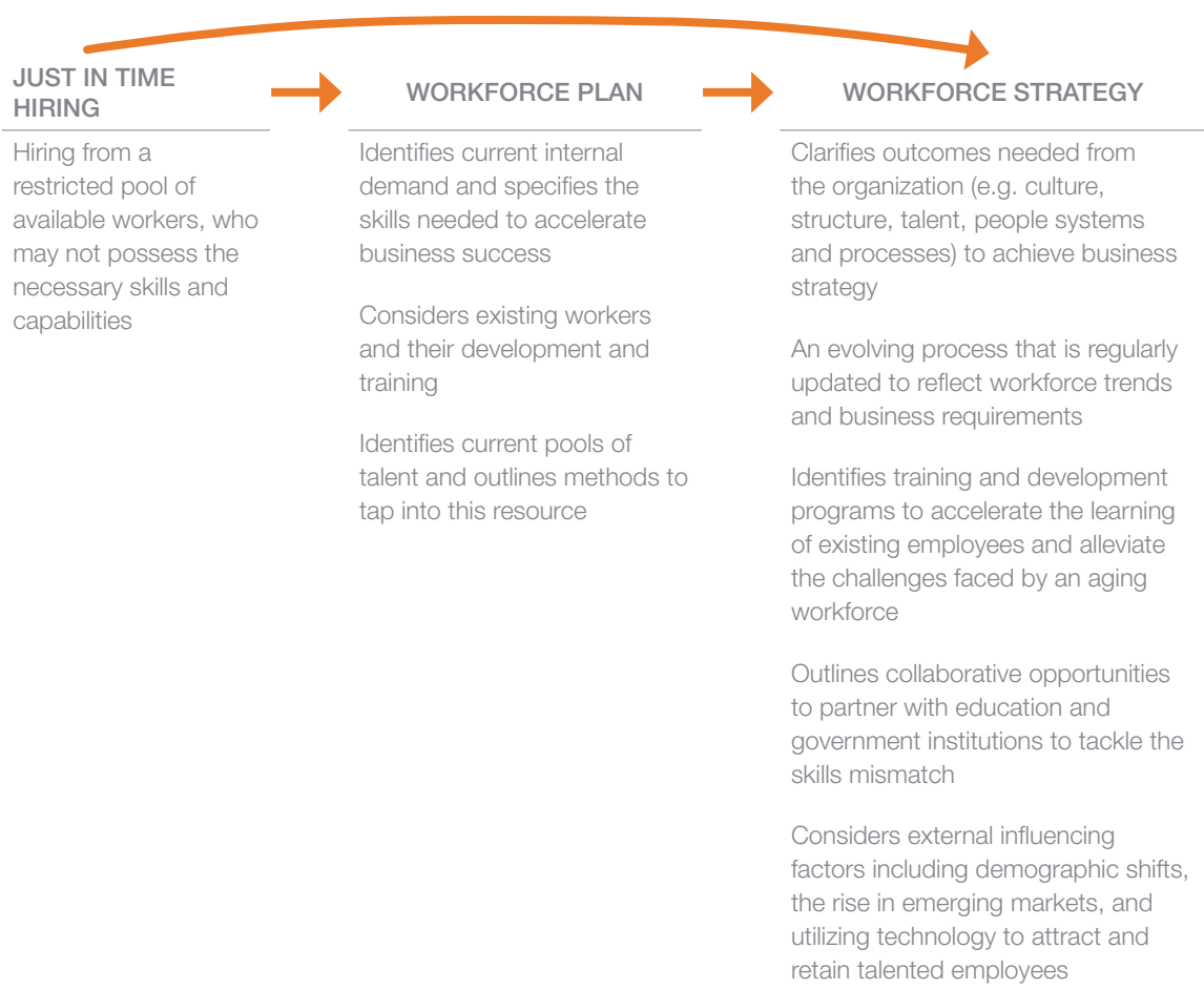
FIGURE 5. MAKING THE JUMP TO WORKFORCE STRATEGY JUST IN TIME